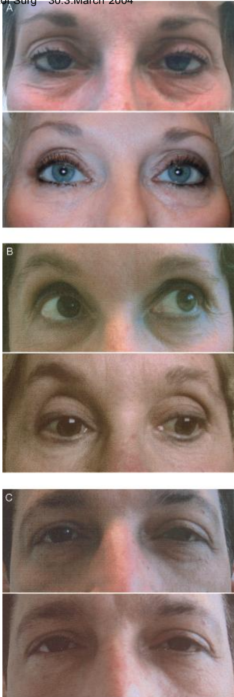
Figure 3. (A) Patient 1 before and at follow-up after four treatments. (B) Patient 2 before treatment and at follow-up 9 months after treatment. (C) Patient 3 before treatment and at follow-up after five treatments.

infraorbital region immediately after injection. This resolved in three patients consistently during their visits. Only one participant (patient 6) experienced neither erythema nor prolonged edema (lasting beyond the time for the injected solution to disperse). Seven